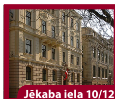
Jēkaba iela 10/12