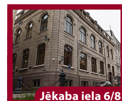
Jēkaba iela 6/8