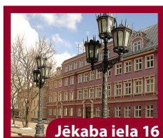
Jēkaba iela 16