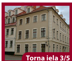
Torņa iela 3/5