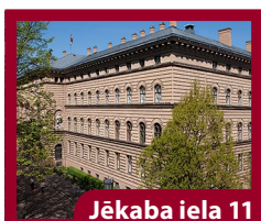
Jēkaba iela 11